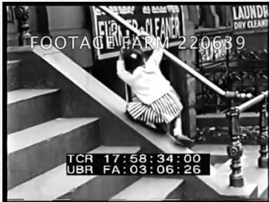
My own yard to play in (1959)